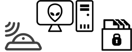
Separate Sensor, Server, and Logger components